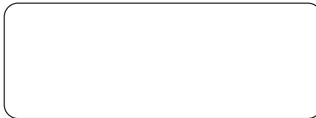
90 x 32 BATTENS/SCREENING