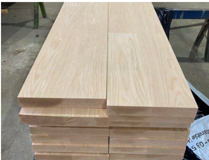
Set width in small packs