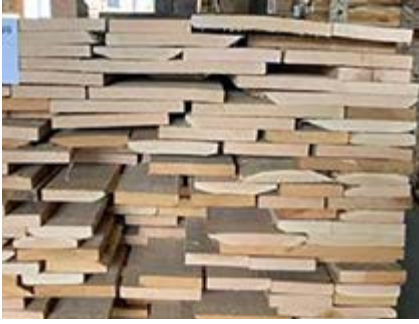
Random widths with want, wane, cupping, end splits and in very large packs