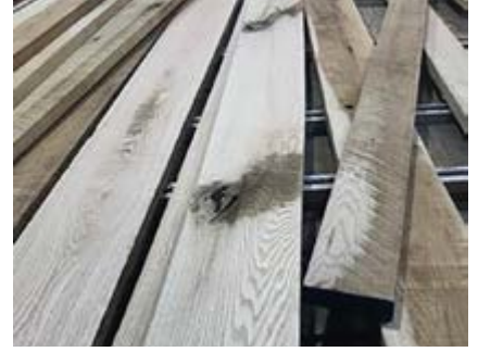
Large knots and defects mid length