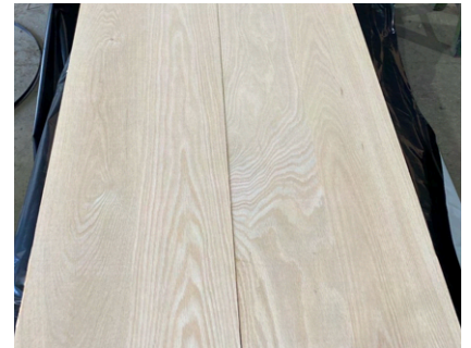
Fault docked and well graded