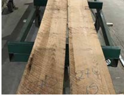
Boards with cupping and spring